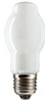
Halogena and BTT over 75W

Very popular BTT shaped lamps will be restricted to the 60W clear lamps from September. All the higher wattage's and opal lamps will go.