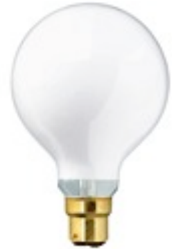
Globe and Rounds

There is no escape for these either. Some large globes can be replaced by energy saving versions, but right now there are no dimming versions. So if you need to use a dimmer you will need to stock up.