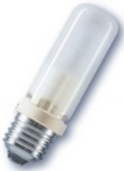
Osram Halolux Frosted Halogen

This popular halogen lamp is also going only the 75W clear lamp will remain on sale for the following 12 months.